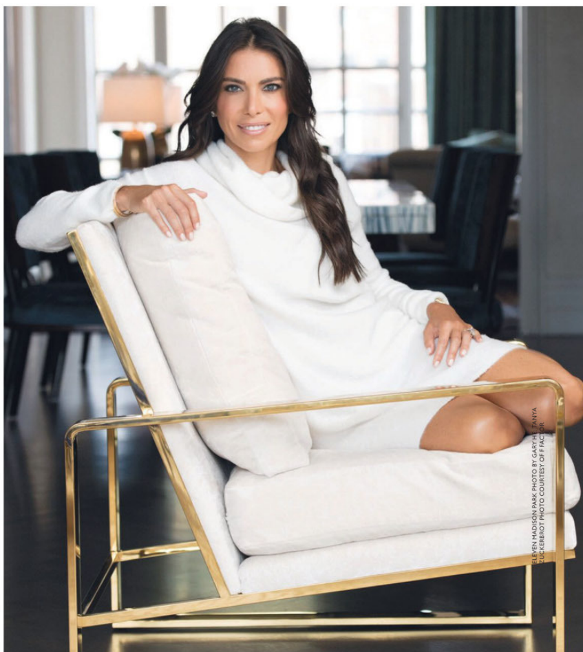
ELEVEN MADISON PARK ZUCKERBROT